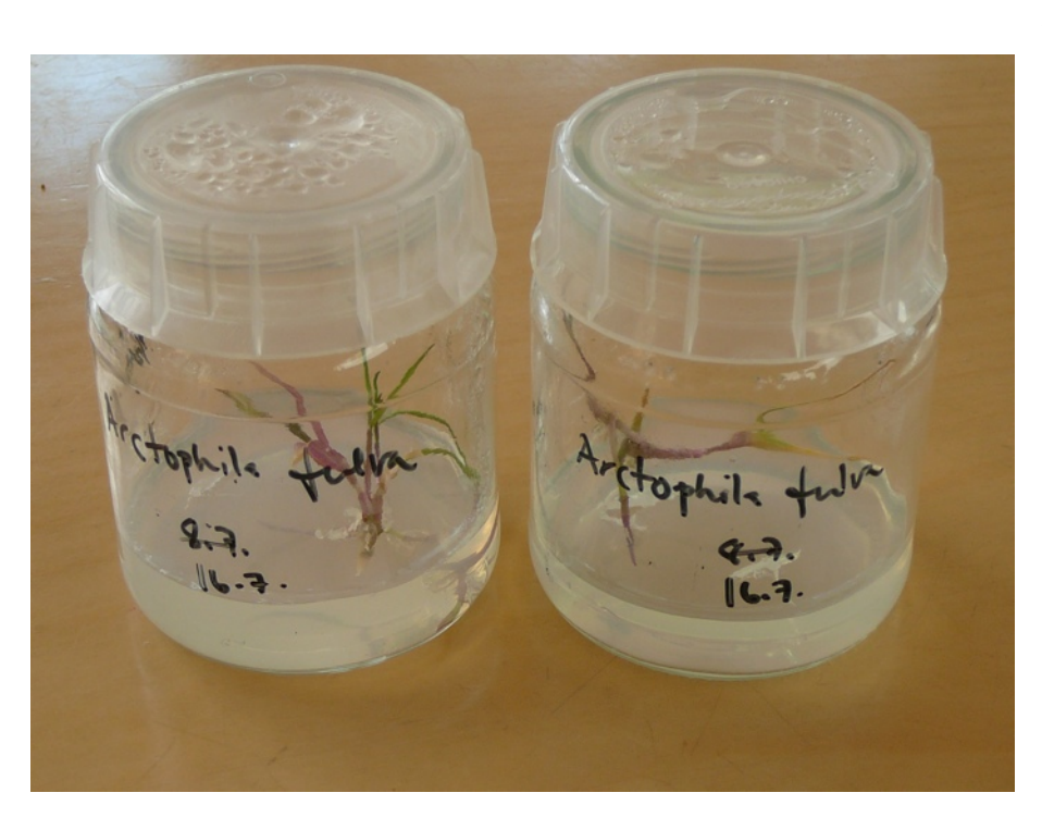
Fig 1. Endangered grass species, Arctophila flulva, in micropropagation.

In Kumpula Botanic Garden (Finnish Museum of Natural History, FMNH) there is room reserved for the infrastructure of a national seed bank. Funding of the seed-bank is, however, still